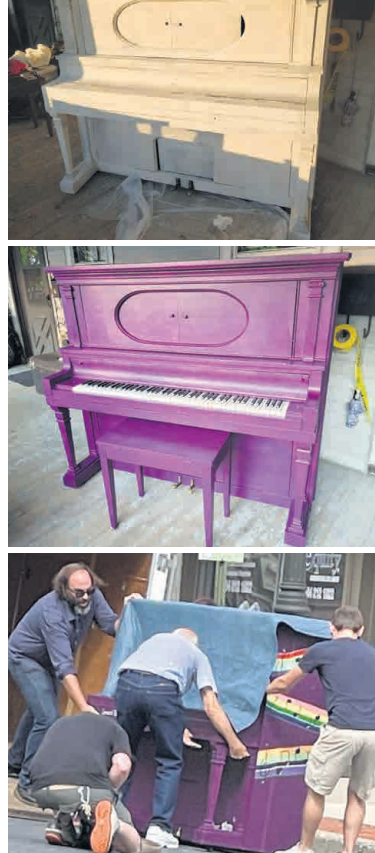
Moving of the piano