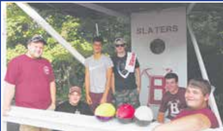
2017 Slaters Football Members