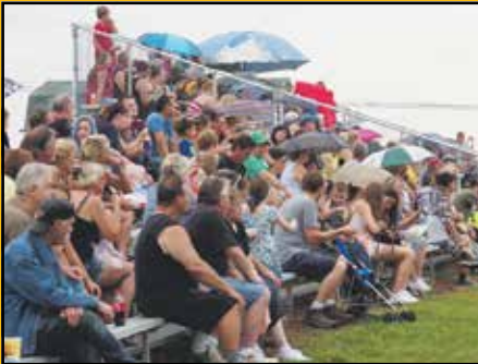
The rain didn't keep spectators away at the Demolition Derby