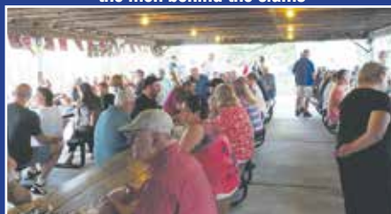
The Hungry crowd indulging in the freshly steamed clams