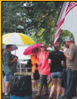
The Line for Milkshakes despite rain