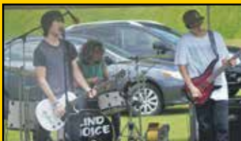
The band "Blind Choice."