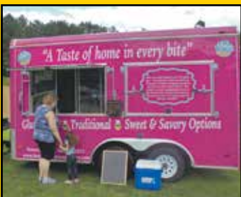
Kendras Buttercup Bakery