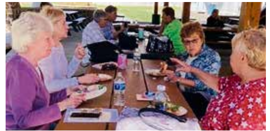
Pictured: Club members at the fall meeting