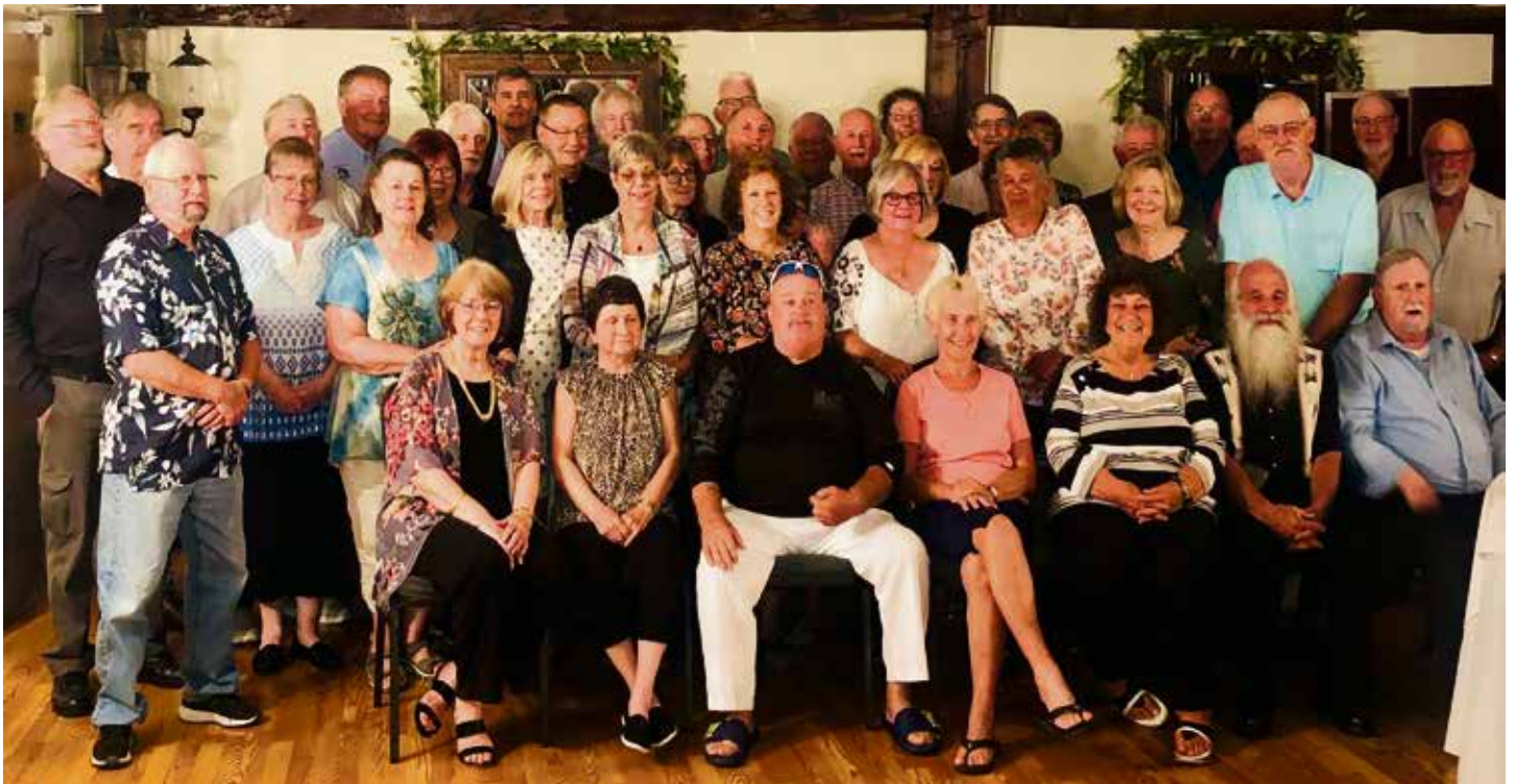
On Saturday, August 17, 2024, 42 members and their guests, of the Bangor Area High School Class of 1969 celebrated their 55th Class Reunion at the Loft at Sawmill Golf Course in Easton, PA.