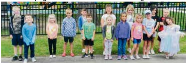
Pictured: Children at the final BMCL Summer Fun Event enjoyed games, and bubble crafts at Weona Park.

The Blue Mountain Community Library is located at 216 S. Robinson Ave. in Pen Argyl. Hours are 10-12, Monday thru Saturday mornings and 6-8, Monday and Thursday evenings. All information is available on our Facebook page and website @www.bmcl.org