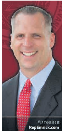
Visit me online at: RepEmrick.com

The Portland Upper Mt Bethel Food Pantry P.U.M.P. is open Mondays 8:30am to 11:30am . For the safety of all please remember masks are required. P.U.M.P. is located at 111 State Street in Portland. The phone number is 570-897-5847.