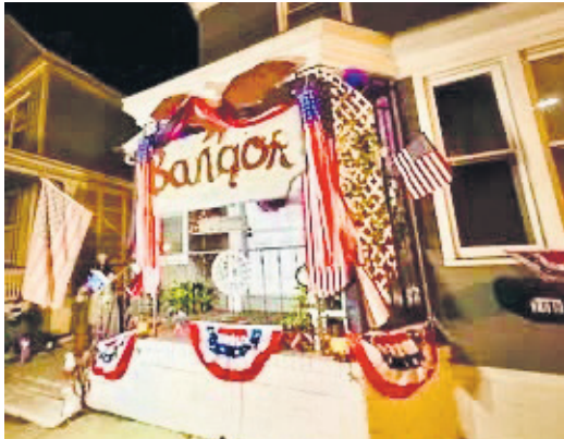
2nd Place Winner, 26 South 1st Street Prize $250 Gift certificate to ACE Hardware