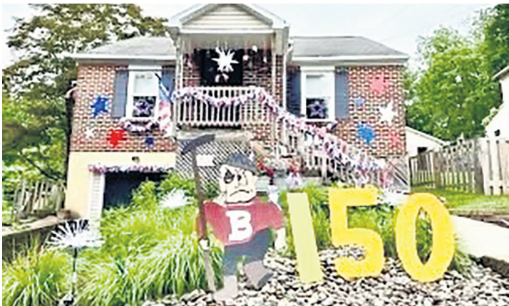
3rd Place Winner, 352 South 4th Street Prize- $150 Gift certificate to Weis Market