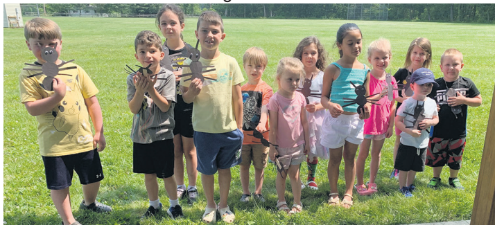
The Blue Mountain Community Library kicked-off the first session of our Summer Fun with the Library program on Wednesday, June 11th. All participants enjoyed a morning of learning about "Living Things" and searched for insects at the Plainfield Township Pavilion.

The Blue Mountain Community Library is located at 216 S. Robinson Ave. in Pen Argyl. Hours are 10-12, Monday thru Saturday mornings and 6-8, Monday and Thursday evenings. All information is available on our Facebook page and website @www.bmcl.org