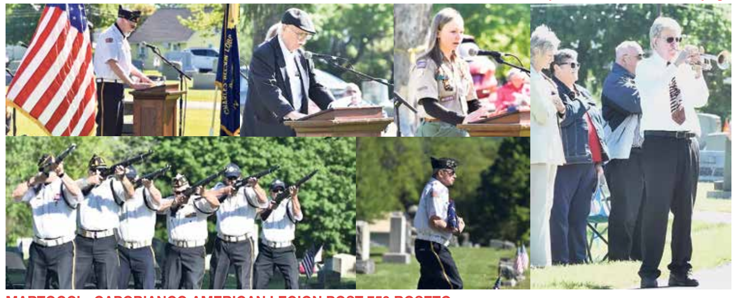
MARTOCCI - CAPOBIANCO AMERICAN LEGION POST 750 ROSETO