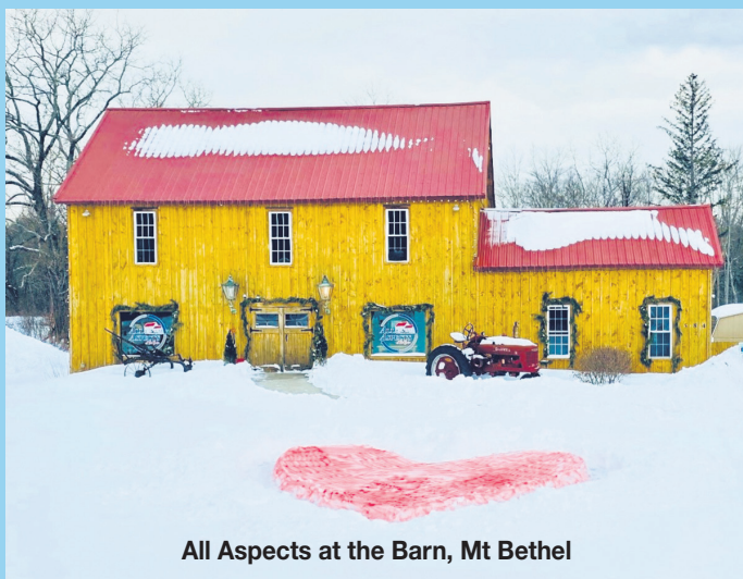
All Aspects at the Barn, Mt Bethel