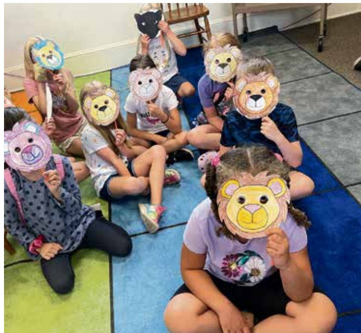
Children enjoy story time at the Bangor Library summer reading program. This year's theme is "Adventure begins at your Library."